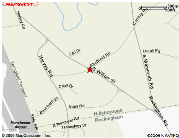
8050 South Willow Street Manchester, NH