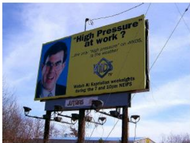
8040 SWillow SB.JPG