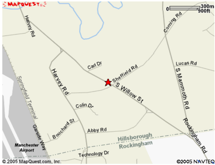
8040 South Willow Street Manchester, NH