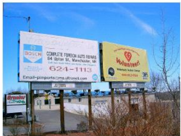
8050 SWillow NB.JPG