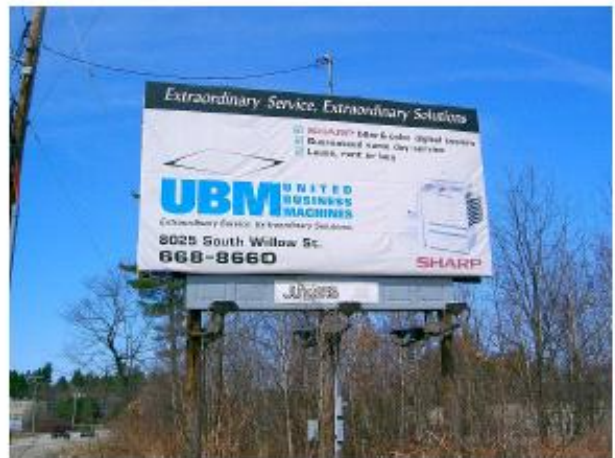
8040 SWillow NB.JPG