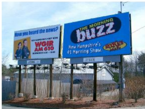
8050 SWillow SB.JPG