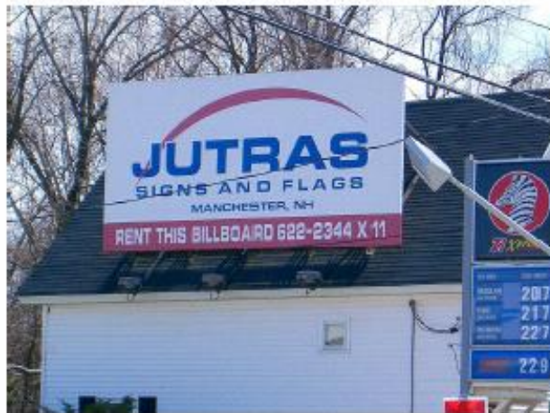
676 Second SB.JPG